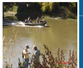
Trina Mackie, DHS, interviews an angler at Grasslands State Park. Understanding anglers' preferences and eating habits enables mercury testing and health advisories to correspond with actual fishing practices.

In 2006, fish sampling for advisory development through the Fish Mercury Project will focus on fishing sites in the north Delta and the Sacramento River from the north Delta to Lake Shasta, including other waterbodies in this area.